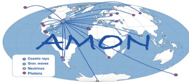
Figure 1. Schematic of the AMON system, indicating the different types of observatories with their approximate locations around the globe. The central point designates the location of the AMON servers at the Pennsylvania State University in University Park, PA, USA.

will see transient or unusual flaring activity in the specified direction. The SuperNova Early Warning System (SNEWS) [33] network, running for well over a decade, is an early example of a virtual observatory. SNEWS uses sub-threshold neutrino signals from multiple detectors to increase our aggregate sensitivity to supernova neutrino bursts. Started in 2009, the Astrophysical Multimessenger Observatory Network (AMON) [34, 35] has created a virtual observatory with multiple particle astrophysics detectors sharing their sub-threshold data in real-time, and multiple follow-up observatories agreeing to view regions of the sky in response to coincidence alerts. More recently, The Astronomy ESFRI and Research Infrastructure Cluster (ASTERICS) [36] is being constructed with similar goals in mind. We focus the rest of this proceeding on the design, current status and near-term future plans of AMON.