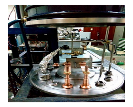
FIG. 2: Inside view of evaporation assembly at IUAC, New Delhi.