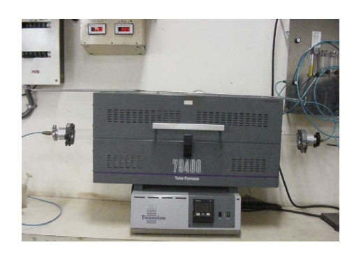
FIG. 3: Tube furnace used for annealing at IUAC, New Delhi.

over the Ba Cl_2 by electron gun bombardment without disturbing the vacuum. The carbon deposited glass slides were annealed in a tubular furnace at a temperature of 325^{\circ} C for a period of 60 minutes in the environment of dry nitrogen to relieve the internal stress before separating the film from the slides. Fig. 3 represents the furnace tube used for annealing the deposited films. Gd<sup>160</sup> was deposited on the annealed carbon glass slides which were