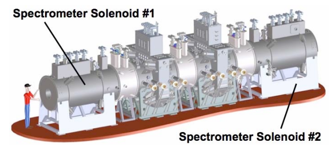
Figure 1: CAD model of MICE cooling channel layout.

diameter volume. The two match coils operate as a focusing doublet to match the beam to the adjacent AFC modules. Additional details of the spectrometer solenoid design and operating parameters have been presented in a previous paper [4].