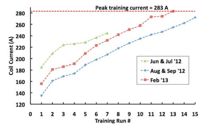
Figure 4: Center coil current during recent training runs.

During the third training run series, the center coil current reached the target value of 283 A, and the operational current was successfully held constant for a period of 24 hours, thus satisfying the acceptance criteria. The progression of training currents in the center coil is shown in Fig. 4 for the three runs. From the figure, it can be seen that retraining was always required after warming up the magnet. Also, the initial quench current for the training varied from a low of 135 A to a high of 185 A. The slope of the training curve was similar for all three series. The final training sequence went from 156 A to 283 A with 12 quenches in between. Our analysis of the fast coil voltage data indicates that these were all normal training quenches.