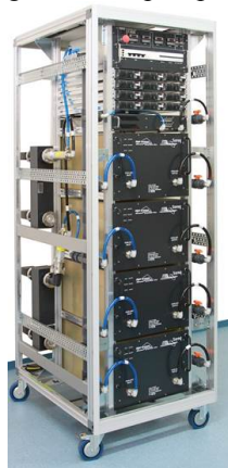
Figure 4: 20 kW amplifier used for conditioning and testing of the couplers.

A 20 kW solid-state RF amplifier designed by SNRC [7] and manufactured by ELIBTELISRA [8] was used in the couplers test. Figure 4 shows the RF amplifier used for tests and conditioning of the coupler prototypes.