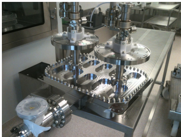
Figure 3: Two couplers fixed on their conditioning box.

Figure 3 shows couplers 1 and 2 assembled to their conditioning box.